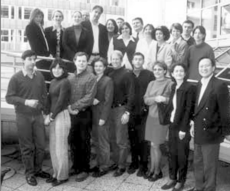
CEP Country Directors and staff members at the Citibank workshop. The next session is scheduled for March 2001.